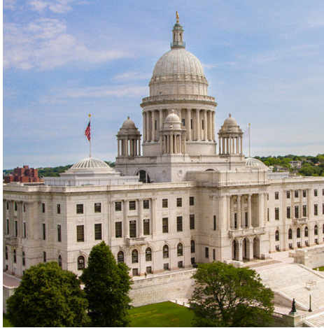
But he has vowed to cut government spending, and Republicans in recent years have cut from Section 8 housing vouchers and other Department of Housing and Urban Development programs. During his first term, Trump proposed cuts to

President-elect Donald Trump made few specific housing commitments during his campaign.